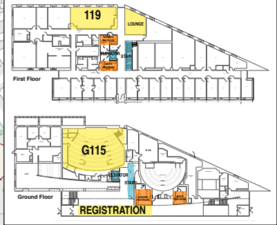
Maxwell Dworkin Floor Plan